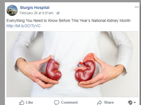
Promoted Facebook posts to increase exposure & engagement

Want to learn more about how our solutions can generate connections for your business? Contact us today!